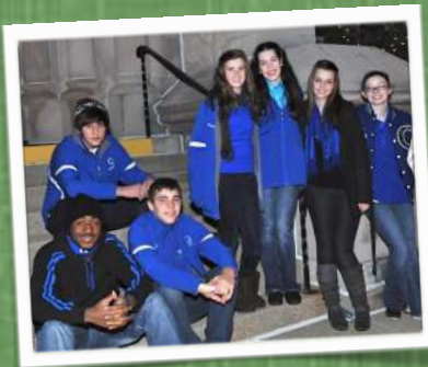
Students from Chaminade-Julienne High School will sing hymns